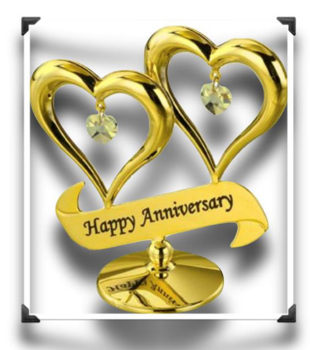
"thanks" for the memories